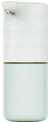
Foaming Soap Dispenser (Touch Switch)